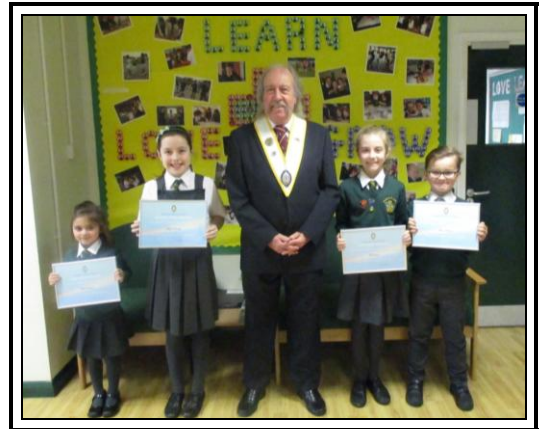
Winners and Runners up at St. Joseph's School, Chalfont St. Peter.

We pray for all young people that they may grow in the likeness of Christ, in Wisdom and Grace.