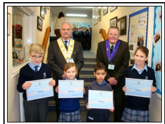
Winners and Runners up at St. Teresa's School, Princes Risborough.

We will continue to Serve God by Serving Others in 2018.