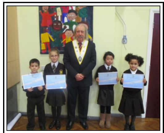
Winners and Runners up at Our Lady's School, Amersham.